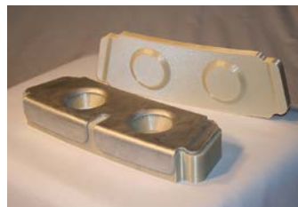
Initial forming on FDM tool and pressure intensifier to be applied.