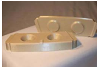
Ultem 9085 female tool and intensifier.

Recommended forming pressure range for FDM materials.