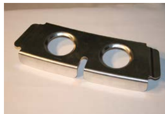
Structural component formed in 2024-0 aluminum.