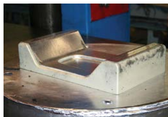
FDM tool forms sheet metal (top) on 1,000 ton rubber pad press (center). Finished piece (bottom).