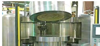
Hydroforming press.

FDM tools can help companies move from tool design to production in as little as a week. Many FDM tools can be completed in less than 24 hours with lights-out fabrication. Switching to FDM requires little change to current practices and procedures yet offers significant reductions in the time required to produce good parts. FDM reduces the cost for die production by 50% to 70% and reduces lead time by 60% to 80%. There is virtually no limit to the geometries that can be produced with FDM so it is often possible to implement design improvements in the end product. In fact, 3D Production Systems offer greater cost and lead time advantages with more complex and organically shaped parts when compared to CNC machining.